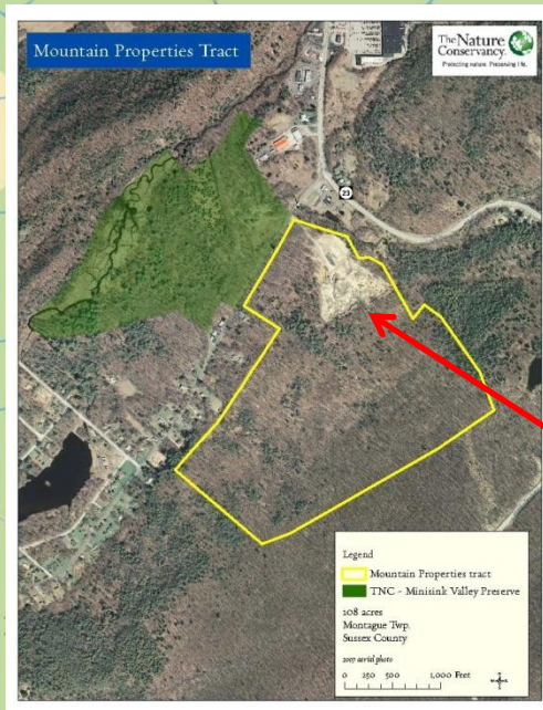
Inset: Satellite photo of Minisink Valley Preserve, including the 2010 acquisition (yellow border) and the former mining site (white patch at northern end).